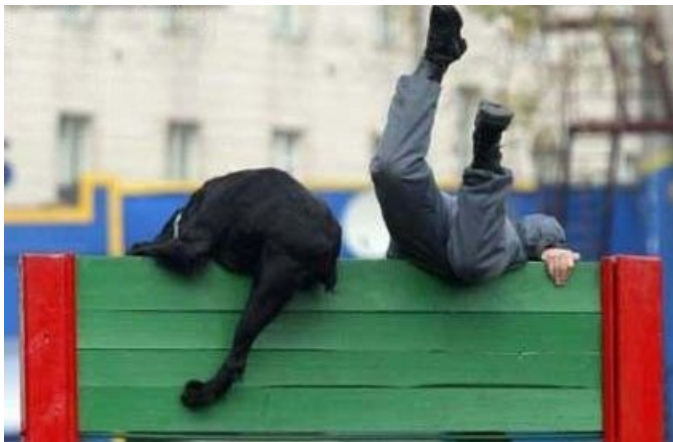
The trainer was in great shape – the dog was put on a diet!

As the foursome hobbled towards the hospital entrance, brandishing canes and walkers, my mother quipped, "Mercy! I hope they don't admit us before we get to the maternity ward."