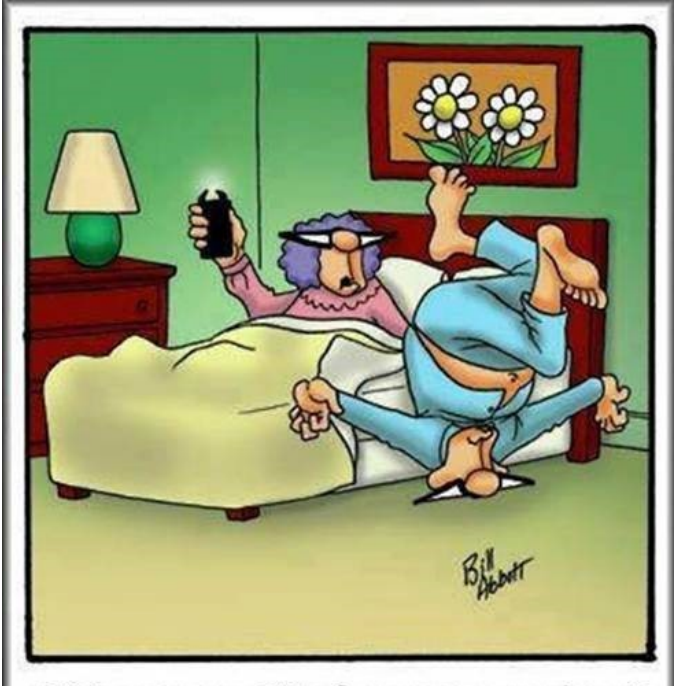
"It's a taser. It's for your snoring."

The officer replies "About 4 1/2 gallons, but a lot of folks are still siphoning."