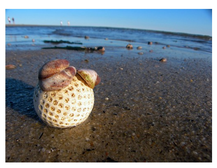
My golf ball finally surfaced...two years later.

And with that, he opened the door and stepped out, falling into the water.