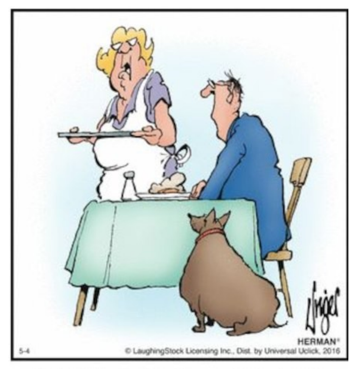
"I don't know how you manage to eat all my cooking and never put on any weight."

A few days later, my mother died of a massive heart attack. It happened so suddenly that I didn't have a chance to do anything for her. Some time later, I received an envelope with a copy of a restaurant receipt from the same place mother and I had dined.