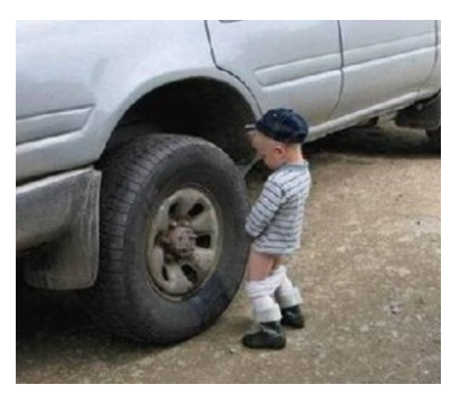
There's nothing like going on the deer hunt!

"Well no," the tourist said, "I didn't realize that. But it's all right. I'll trust you anyway."