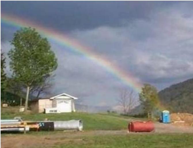
Some pictures just deserve an encore! "Rainbow's End!"

Memo No. 7: Because of lack of participation, Casual Day has been discontinued, effective immediately.