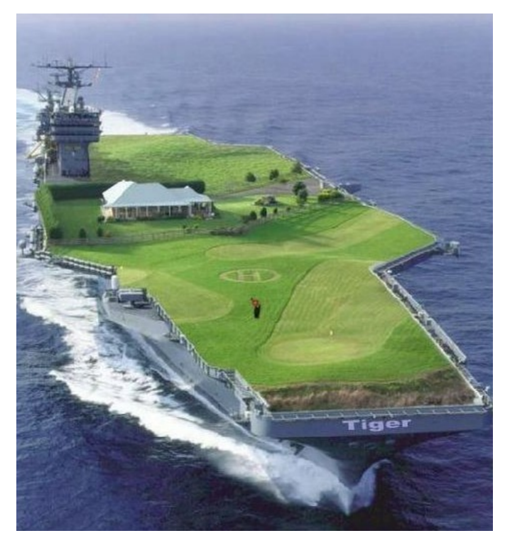
The Admiralty has contingency plans for decommissioned aircraft carriers.

The husband reached up to the dash, grabbed an open box of snacks, and said, "Here, have another cookie."