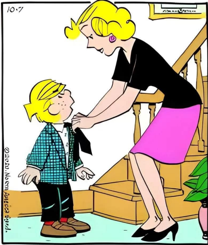
"HOW COME WHEN YOU DO SOMETHING FOR MY OWN GOOD, I KNOW I'M NOT GONNA LIKE IT?"