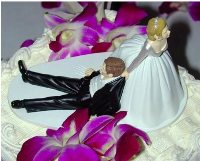
An indication of things to come...

A young man excitedly tells his mother he's fallen in love and is going to get married.