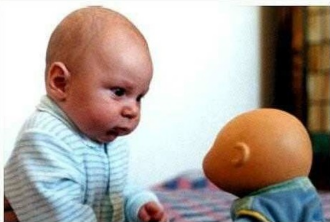
Good Grief...I've been cloned.

"Once upon a time there was a really big red lobster ..."