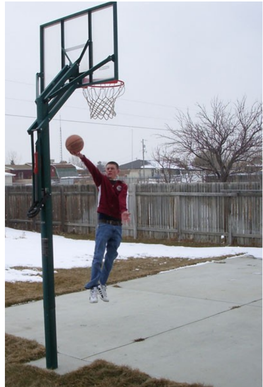
Basketball is good anytime, anywhere, in any kind of weather!

Dad, you shouldn't have to mow the lawn on your birthday." Touched, I was about to turn the mower over to him when he added, "You should wait until tomorrow!"