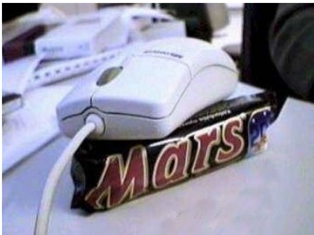
They found a mouse on Mars.

His wife, also in a deep sleep and not missing a beat, yelled back, "Four fifty!"