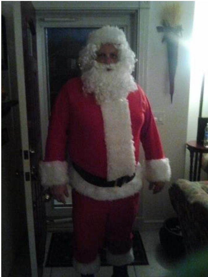
Seen Trick-Or-Treating on Halloween carrying a gigantic empty sack.

The driver rolls down the window. The driver is a squirrel. The squirrel says to the man says, "See, it's not as easy as it looks, is it?"