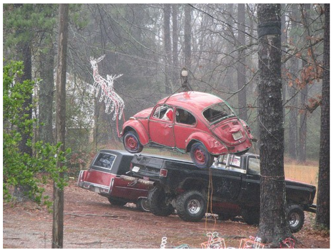
Redneck Christmas Decorations

"Your teachers won't flunk you, So just do your best. Happy Finals to All, And to All, a good test."