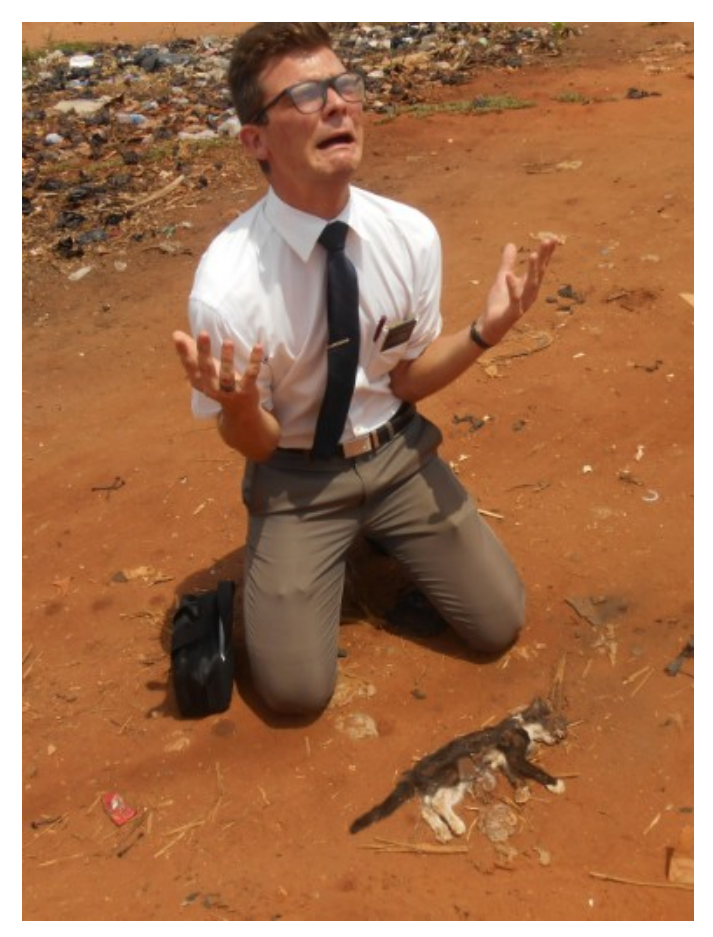
I tried to miss him, Lord, but he just came out of nowhere and I hit him with my bike.

Her older sister jumped right in. "Don't be silly. Dad is the one who drove Mom to the hospital."