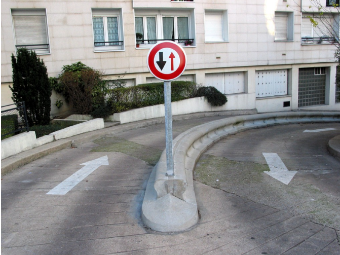
Your "misdirected" road funds at work again!

his sink, he thought: Those crazy guys actually thought they could fool me with that old gag! It was then he realized that "those crazy guys" had removed the drainpipe beneath his sink.