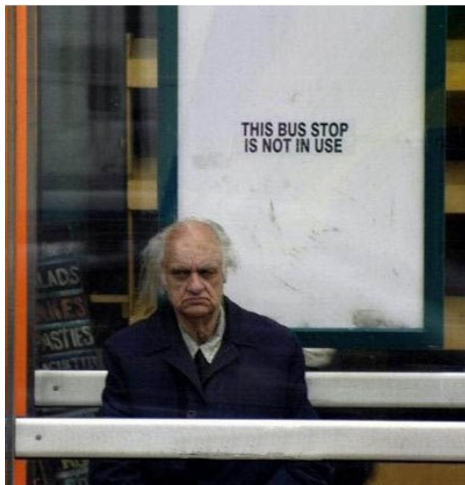
I don't care what it says, I'm NOT leaving until I catch my bus!

"I get in that pen with a good book, a chocolate bar, and the kids don't bother me for hours!"