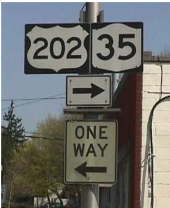
Traffic Engineers? Go Figure!

She replied, "It's me ..... talking to the wine."