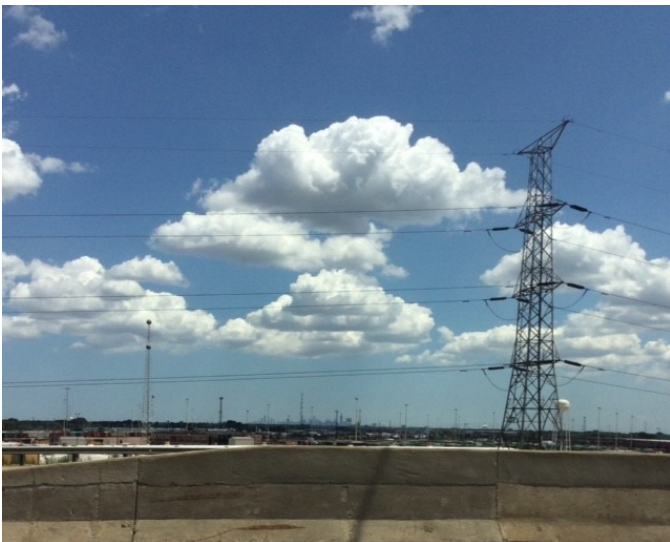
The amount of power needed to keep all the Salt Lake City West Missionary iPads charged.

He paused, scratched his head, turned the page back, read it silently, and turned the page again.