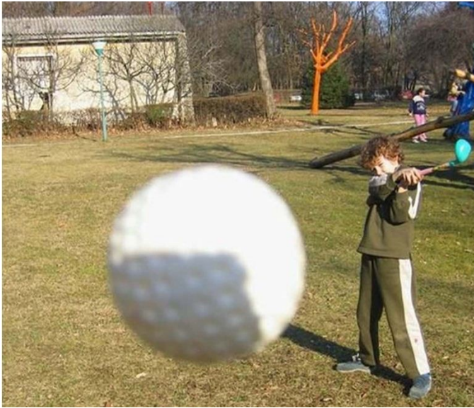
Lucky for me it was a plastic golf ball!

"The jury," he began, "is to convene in the guilty room."