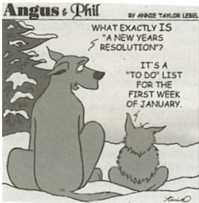
Sometimes they last until the first week of February.

"Because," the man informed me, "I'm the guy who drives the plow."