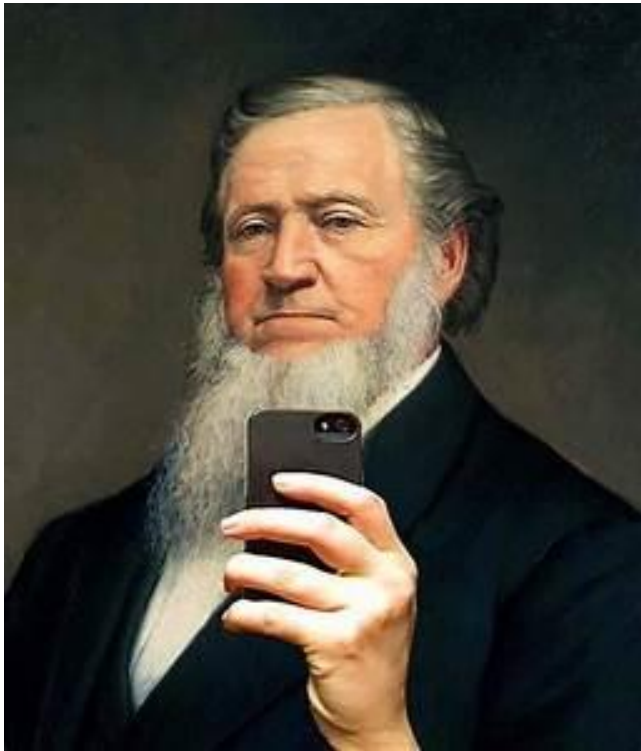
Brother Brigham with an iPhone? That would have been interesting!

A little boy opened the big and old family Bible with fascination, he looked at the old pages as he turned them. Then something fell out of the Bible. He picked it up and looked at it closely. It was an old leaf from a tree that had been pressed in between pages.