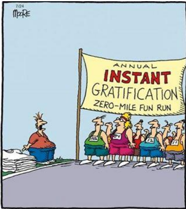
"Runners to your mark. Get set. Go! ... OK, come get your T-shirts."

A: Your heart is only good for so many beats, and that's it...don't waste them on exercise. Everything wears out eventually. Speeding up your heart will not make you live longer; that's like saying you can extend the life of your car by driving it faster. Want to live longer? Take a nap.