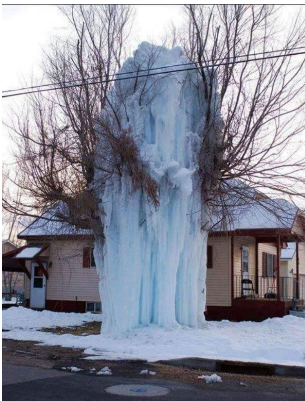
What happens to a fire hydrant break in sub-zero weather.

"Sir," she replied irritably, "I don't have time to answer your questions." Then she hung up.