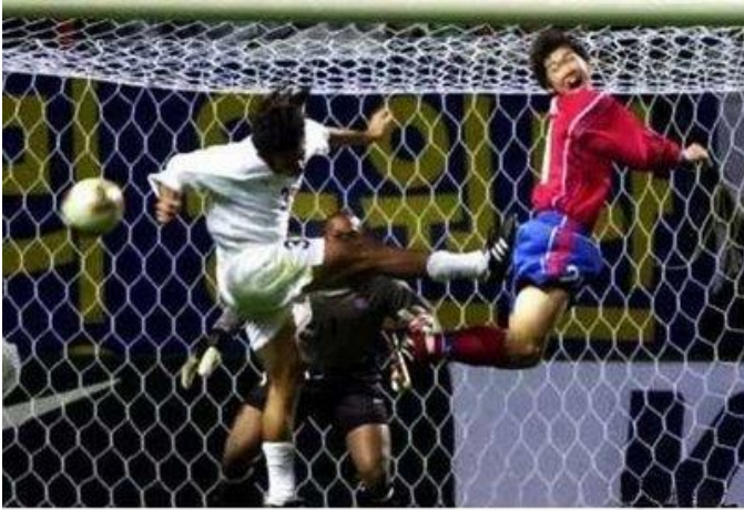
Soccer IS a contact sport!

The letters T and G are very close to each other on a keyboard. This recently became all too apparent to me and consequently I will never be ending a work email with the phrase "Regards" again.