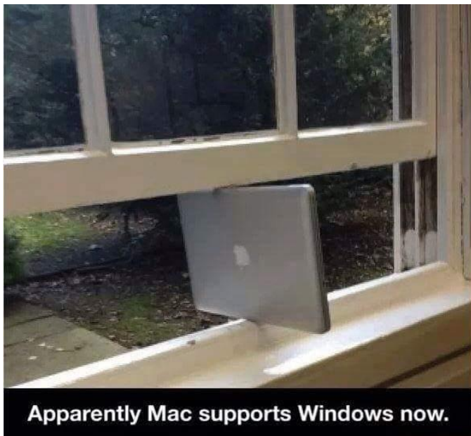
Apparently Mac supports Windows now.

I checked. The net weight printed on the bag was 13.25 ounces. I looked up, certain she was joking. She wasn't.