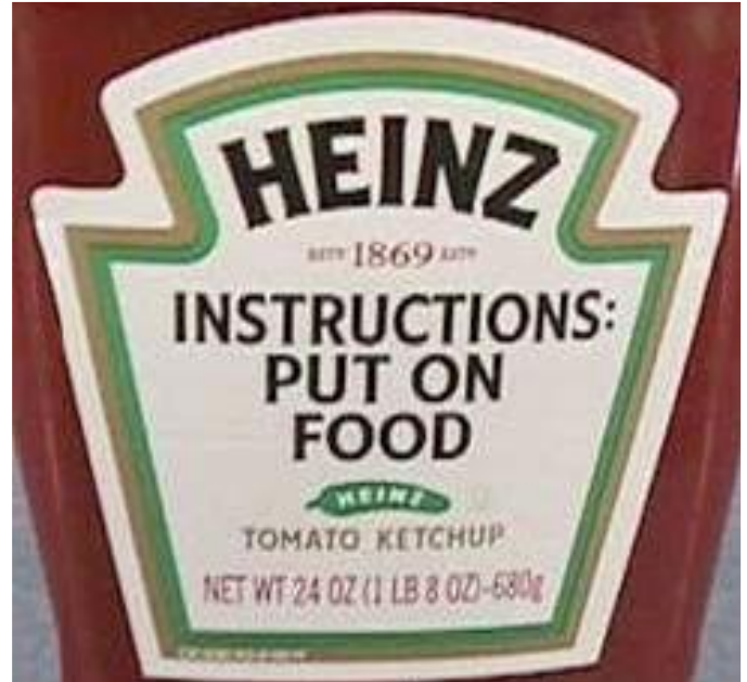
Found on a dining room table at the Chicago Bears NFL Training Camp.

Abraham replied, "I'm paying for the smell of his food with the sound of my money."