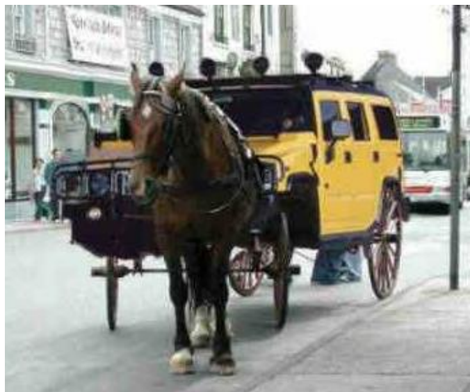
Introducing the latest design from AMISH-ATV; sleek styling, REAL Horsepower!

I had him quickly undress and discovered what I hoped I wouldn't see. Yes, the man had over fifty patches on his body! Now, the instructions include removal of the old patch before applying a new one.