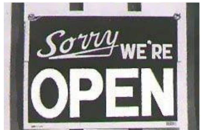
Sign found on a door at a "greasy spoon" restaurant.