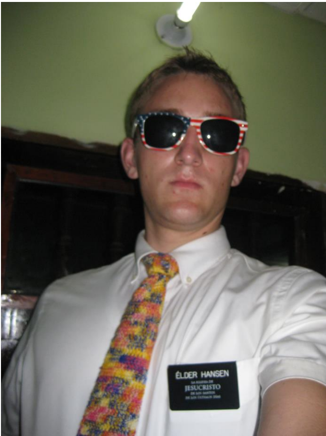
YES! I WEAR A BADGE!

"Why?" came the response. "Do you think I'm going to get younger?"