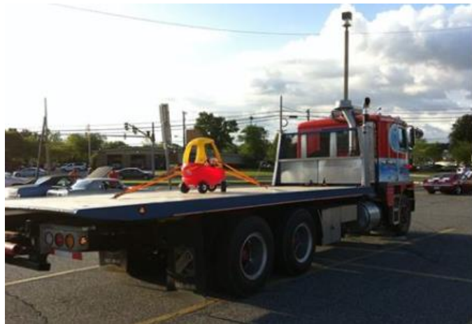
UDOT impounded this vehicle for failing its safety and emissions test.

She looked at me in shock and asked, "Do you mean it was battery-operated?"