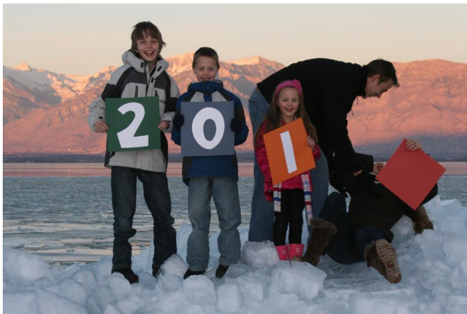
This is from last year – but I just couldn't help but repost it. After all, funny is still funny!

Curious as to how this miracle had been accomplished, I went and checked where my husband always left his notes for the workmen. Posted prominently on the living room wall was my husband's last note: "After January 15, all work will be supervised by 5 children."