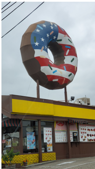
Favorite of Police and Missionaries

"Easy," he said. "All the bad drivers are dead."