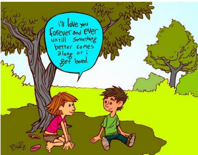
There's a lesson to be learned here.