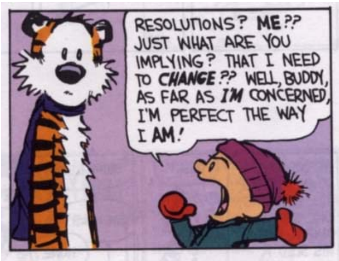
So, how are you doing on your New Year's Resolutions? Yeah, me too!

"Well," said Mom, "Just get one ticket and you'll see how quickly it will disappear."