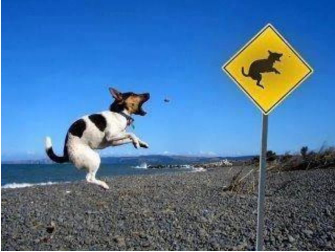
Who says dogs can imitate live?

My wife is a teacher; it's really weird to live with a teacher. I'd be on the phone, doodling on a piece of paper, leave the house, come back in two hours and that same piece of paper is now on the refrigerator with the words "Good work!" and a big smiley face on it.