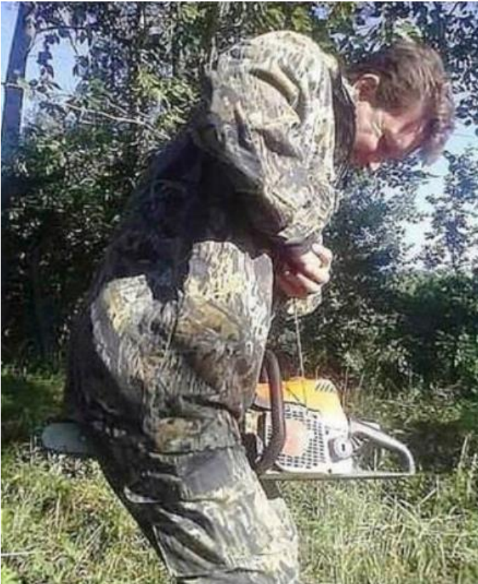
There is dumb – and then there is REALLY dumb!

Mom and the kids had been up in the attic together doing some cleaning. The kids uncovered an old manual typewriter and asked her, "Hey Mom, what's this?"