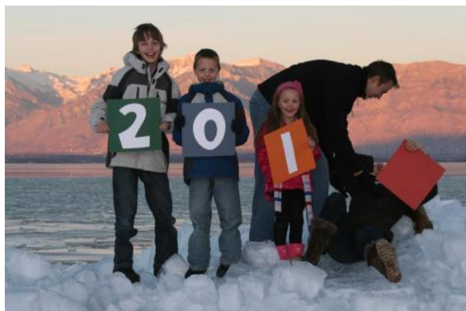
Yeah, sometimes getting ready for a new year can be a little slippery!

"Oh, no," she said. "You can't throw that away. Every time my husband comes home and sees it defrosting, he suddenly remembers seeing a new restaurant we have to try."