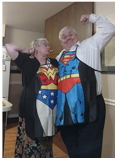
Happy New Year from your Super Heros!

She met the Fortune Teller's gaze, steadied her voice and asked, "Will I be acquitted?"