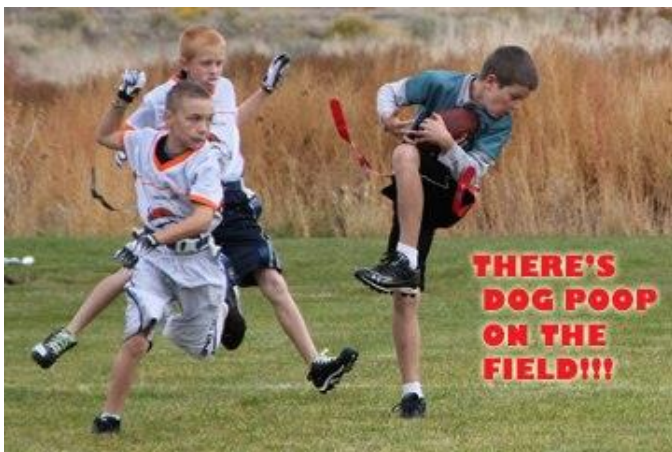
Taken at my grandson's flag-football game October 13, 2012 in Eagle Mountain, Utah.

The child beamed and with great feeling and a loud, clear voice said, "My mother is the light of the world."