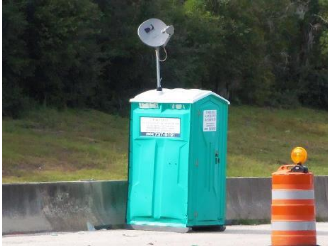
The real reason it took 2 years to finish I-15!!!

"Why, honey," her mother replied, "that must be Cinderella, before she met her fairy godmother!"