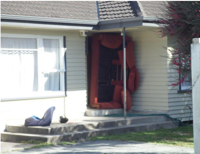
Elders get sofa stuck in doorway during service day.

Professional golfer Tommy Bolt was playing in Los Angeles and had a caddy with a reputation of constant chatter. Before they teed off, Bolt told him, "Don't say a word to me. And if I ask you something, just answer yes or no."