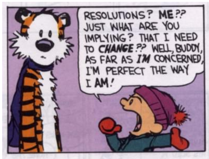
So, how are you doing on your New Year's Resolutions? Yeah, me too!

"Well," said Mom, "Just get one ticket and you'll see how quickly it will disappear."