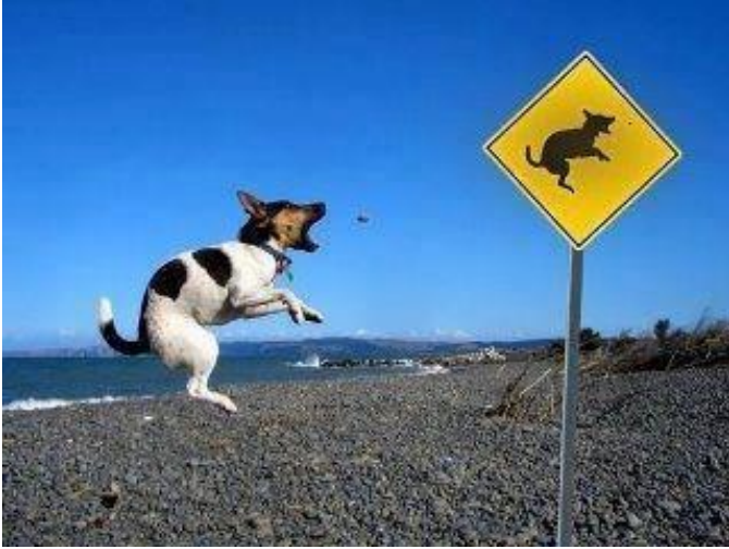
Who says dogs can imitate live?

My wife is a teacher; it's really weird to live with a teacher. I'd be on the phone, doodling on a piece of paper, leave the house, come back in two hours and that same piece of paper is now on the refrigerator with the words "Good work!" and a big smiley face on it.