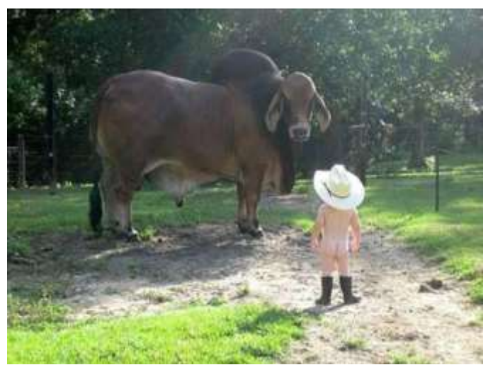
A Real Cowboy FEARS NOTHING... (But his MOTHER is about to have a heart attack!)

"Well," the rancher puffed up, "We got about two and a half inches of that."