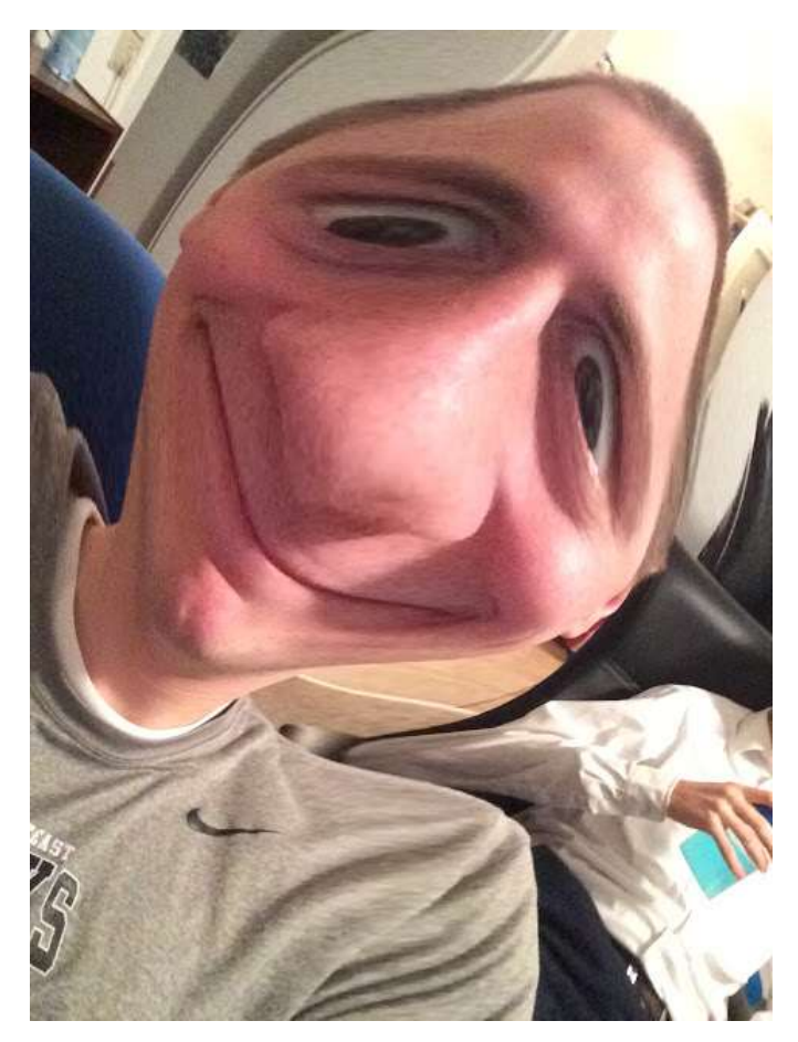
I hope they call me on a mission...

"Er, yes, I did," said the husband. "But I couldn't spell convenience, so I made it risk."