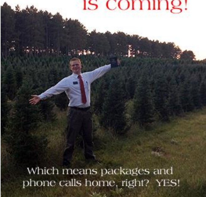
A little bit premature, but you get the hint, right?