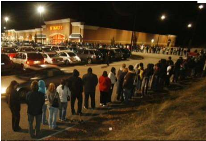
This was last year's Black Friday. This year most people took to Amazon and stayed home.