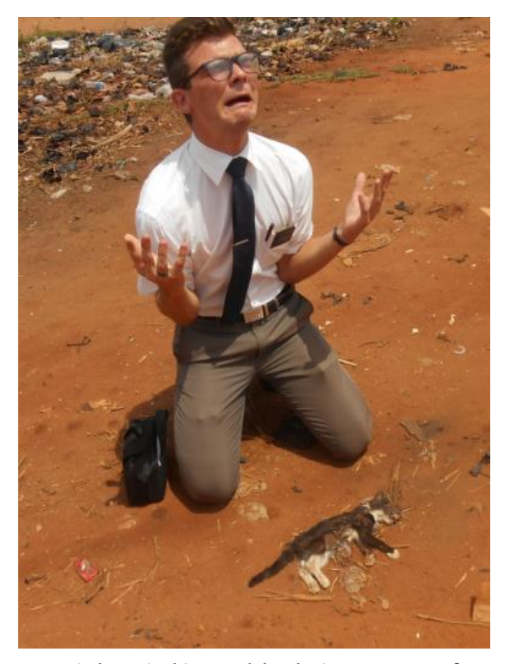
I tried to miss him, Lord, but he just came out of nowhere and I hit him with my bike.

Her older sister jumped right in. "Don't be silly. Dad is the one who drove Mom to the hospital."