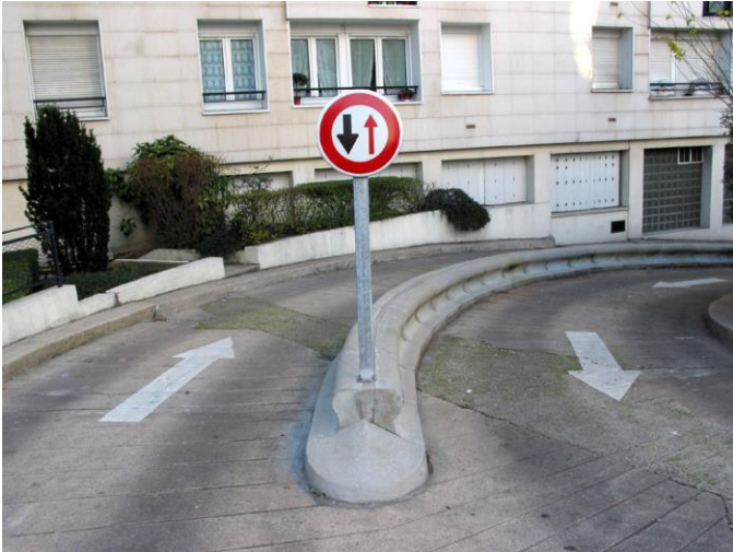
Your "misdirected" road funds at work again!

his sink, he thought: Those crazy guys actually thought they could fool me with that old gag! It was then he realized that "those crazy guys" had removed the drainpipe beneath his sink.