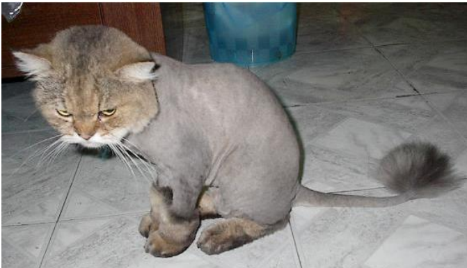
The next time she comes at me with those clippers I'll claw her eyes out!

Her brother, busily occupied playing a game, hardly looked up at her and passed on this encouraging word: "That's not true, Mary. Some people don't even know you."