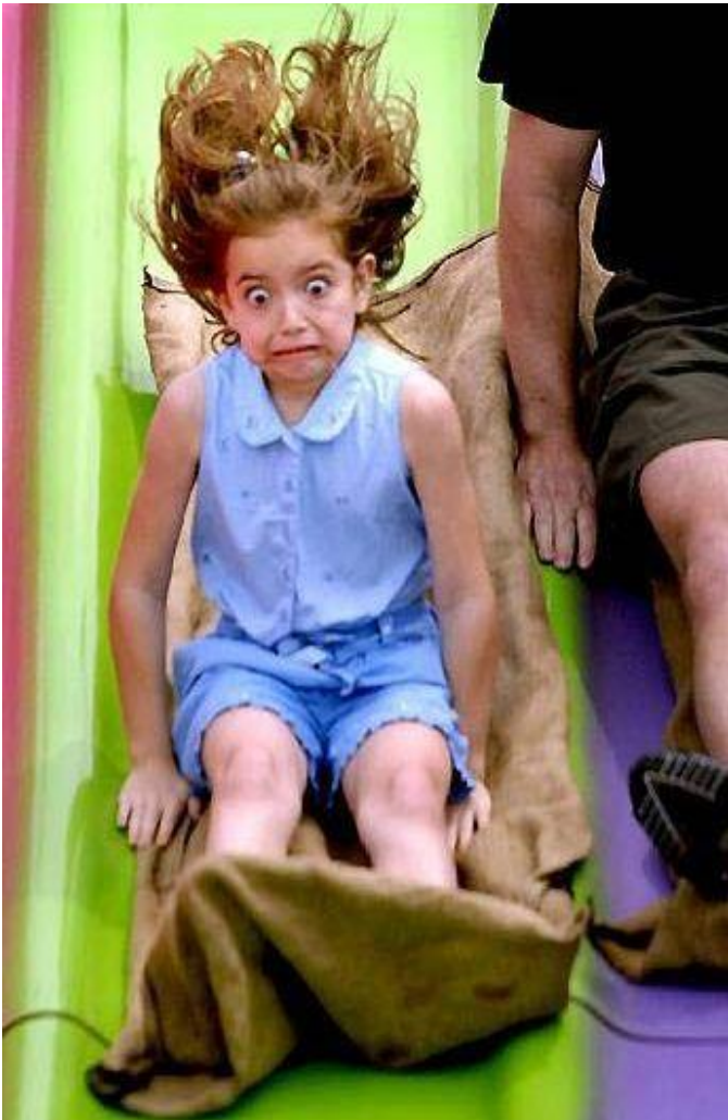
The slide was a bit STEEPER and TALLER than she thought it would be.

"Oh, no..." says the knight. "Well, you do now."