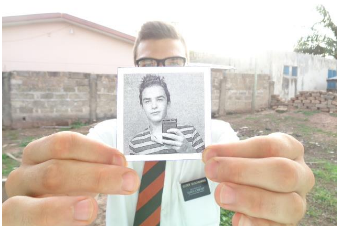
Before and after picture? I can't tell the difference...except for the glasses.

Why does "overlook" and "oversee" mean opposite things?