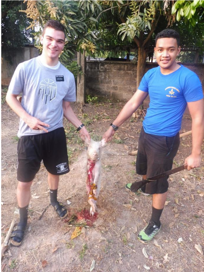
Never mess with hungry missionaries in the African Bush...you might end up being dinner.

"Everyone who goes through sounds like you," she explained.