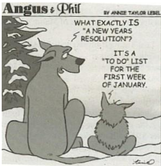
Sometimes they last until the first week of February.

"Because," the man informed me, "I'm the guy who drives the plow."