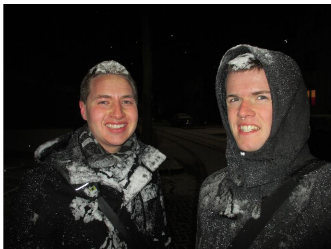
The first gray hair is the worst!

And this one's even better because it locks..."