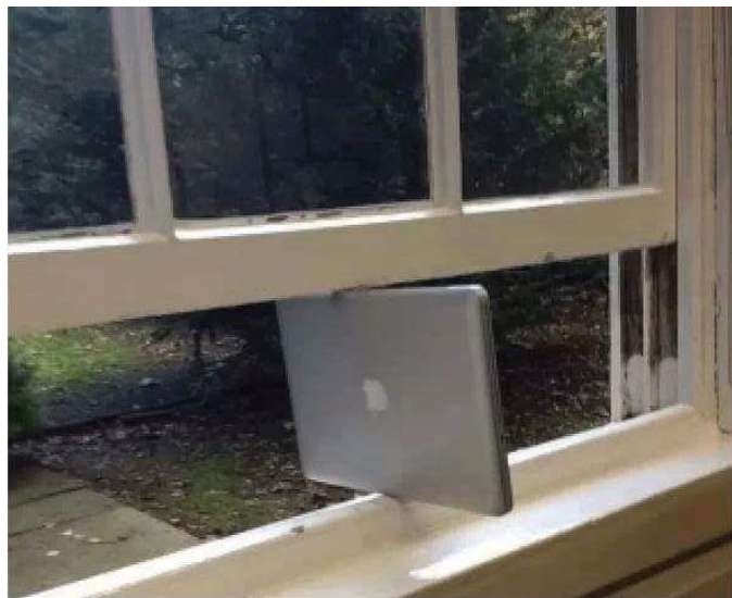
Apparently Mac supports Windows now.

I checked. The net weight printed on the bag was 13.25 ounces. I looked up, certain she was joking. She wasn't.