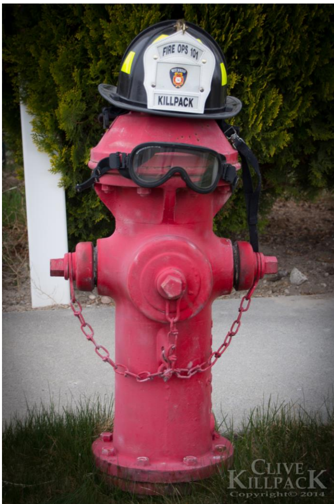
Hey, the photo challenge was fire hydrants.

In general, the report concludes, overweight people are happier, more successful in business, smarter, and friendlier.