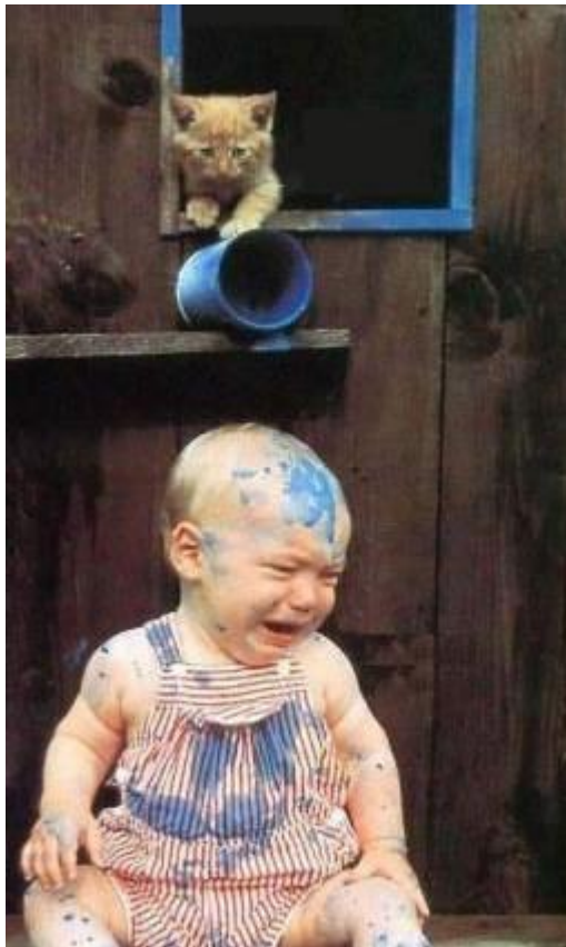
I've hated cats ever since!

On a Spring Break trip, a group from our college had gone to Italy. One day we were standing just inside St. Peter's Basilica, the second largest church in the world.