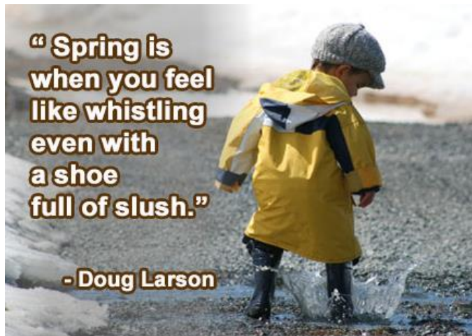
And this year there's lots of slush!

Don't buy a putter until you've had a chance to throw it.