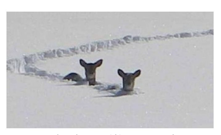
I thought you said it was SPRING!

"Yes," he replied, "she asked me which of the two men in front of the house was my father. But don't worry. I told her I didn't know."