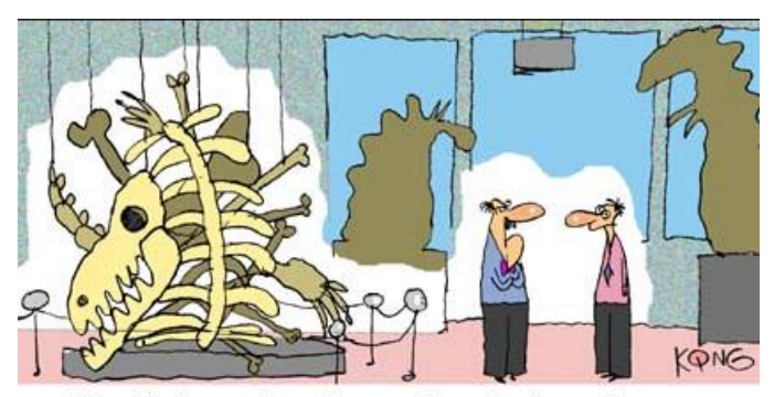
"I told that college intern that the faster he put this dinosaur together, the faster he'd get off to go to Spring Break. Big mistake!"

I'm so tired of exercising. I think five thousand sit-ups or jumping jacks should be pretty much permanent. You should be at home, you're on your last and final jumping jack, and you get that phone call, "Congratulations! You have completed the exercise portion of your life. Welcome to the incessant eating section."