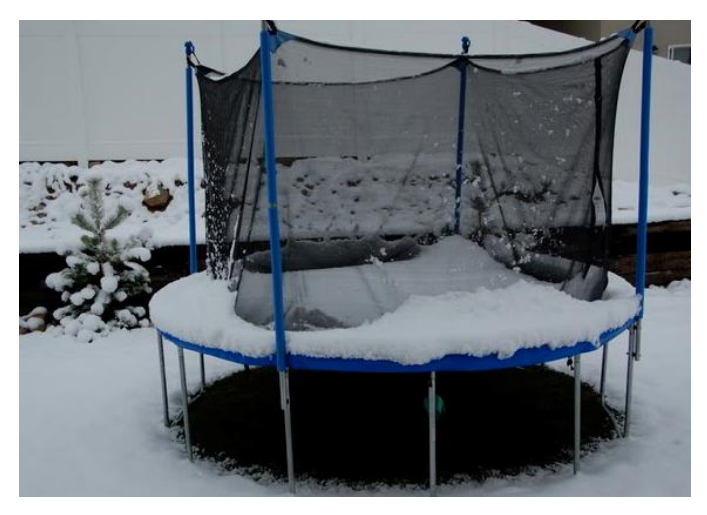
And you thought it was really spring, huh?

She was brought back to earth when the daughter continued, "I want to be a zamboni driver!"