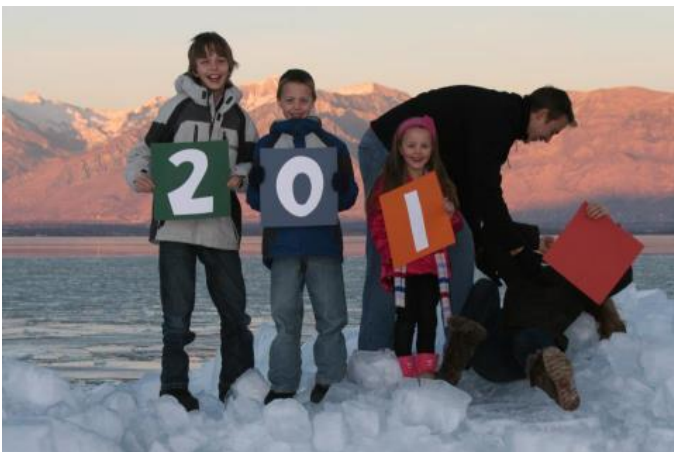
Yeah, sometimes getting ready for a new year can be a little slippery!

"Oh, no," she said. "You can't throw that away. Every time my husband comes home and sees it defrosting, he suddenly remembers seeing a new restaurant we have to try."