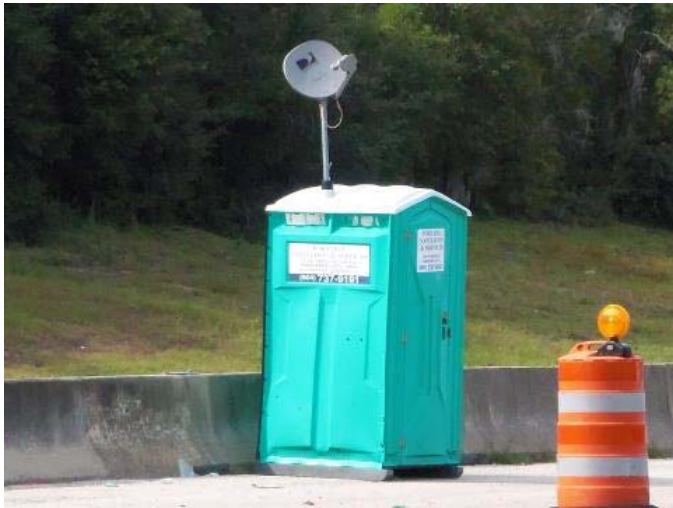
The real reason it took 2 years to finish I-15!!!

"Why, honey," her mother replied, "that must be Cinderella, before she met her fairy godmother!"