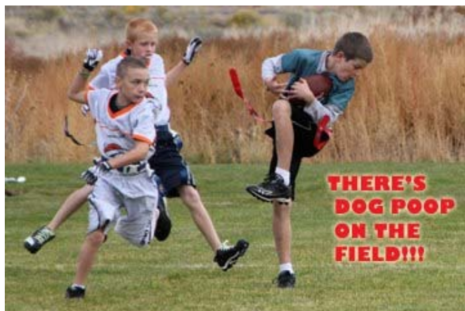
Taken at my grandson's flag-football game October 13, 2012 in Eagle Mountain, Utah.

The child beamed and with great feeling and a loud, clear voice said, "My mother is the light of the world."