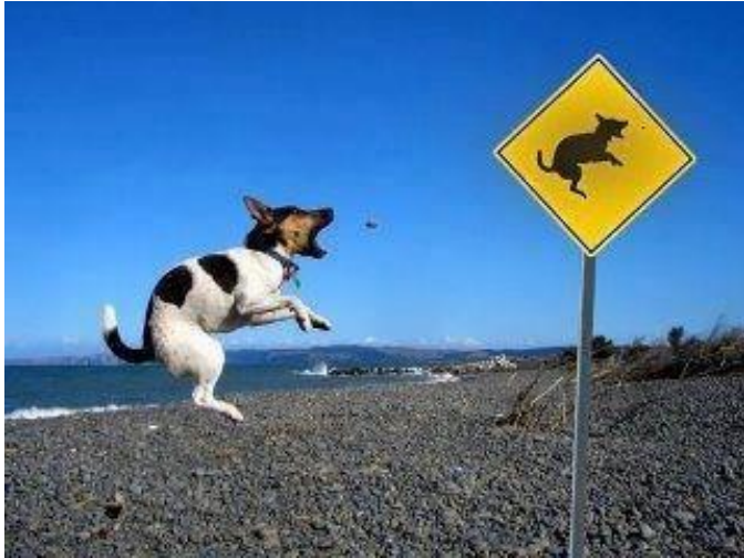
Who says dogs can imitate live?

My wife is a teacher; it's really weird to live with a teacher. I'd be on the phone, doodling on a piece of paper, leave the house, come back in two hours and that same piece of paper is now on the refrigerator with the words "Good work!" and a big smiley face on it.