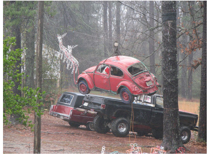
Redneck Christmas Decorations

"Your teachers won't flunk you, So just do your best. Happy Finals to All, And to All, a good test."