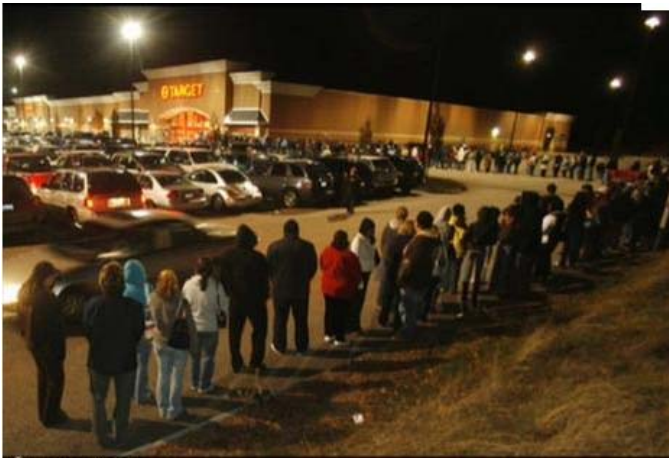
Thanksgiving took a back seat to Black Friday this year...the line started forming on Wednesday.