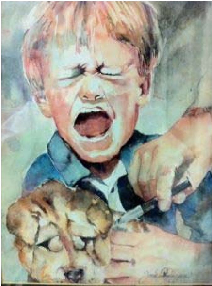
You'd think the kid was getting the shot!