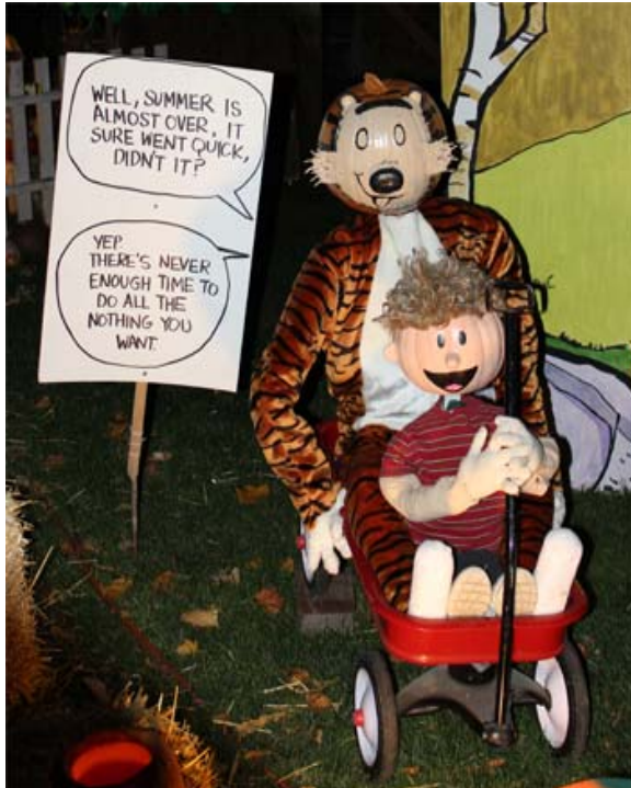
From the "Pumpkin Walk" in North Logan...tribute to Calvin and Hobbes – October 22, 2011.

Her older sister jumped right in. "Don't be silly. Dad is the one who drove Mom to the hospital."