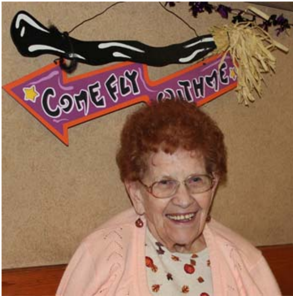
My mother-in-law was born on Halloween – and her grandkids all call her "Granny Good Witch."

"Because," she said, "they've registered for Nintendo games."