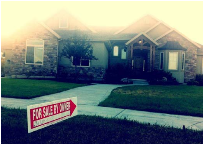
Imagine my daughter's surprise to wake up one morning and find this sign in front of her house? (The arrow actually points to a vacant lot next door).

My toilet seat, it seems, is "Dishwasher Safe."