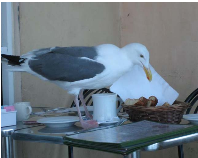
Heathcliff was right. This menu is for the birds!