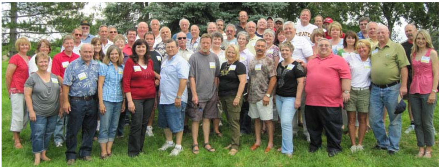
Cyprus High School Class of '69 – 60's Birthday Bash – August 20, 2011 Hunter Park, West Valley City, Utah

My wife and I have a system for settling arguments. We just talk and talk until she's right.