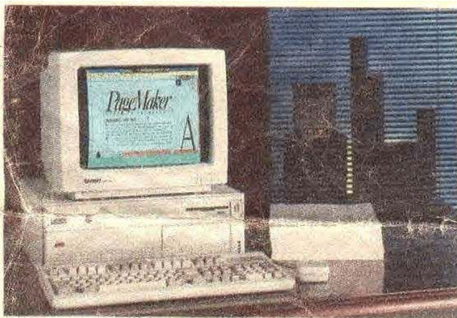
Tandy 5000 MC Professional System

The wife looked over at him, and before she could stop herself, she said, "Well, it sure did taxi long enough!"