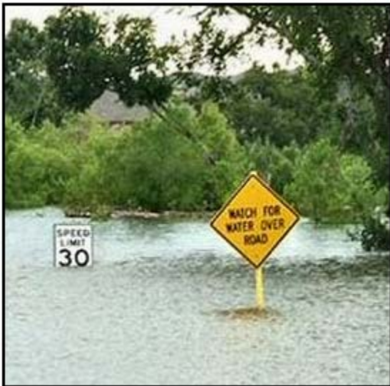
The "spring" floods are finally here!

It took the jury only twenty minutes to find him guilty.