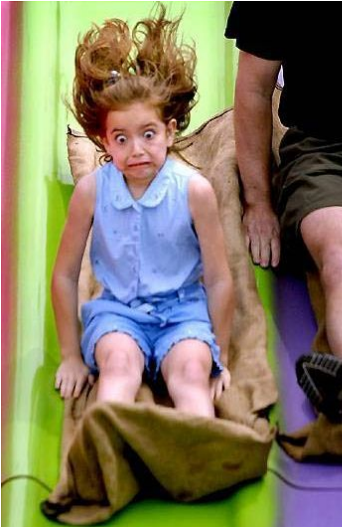
The slide was a bit STEEPER and TALLER than she thought it would be.

"Oh, no..." says the knight. "Well, you do now."