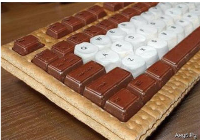
A Choco-holic's dream...and nightmare...come true!

"My opponent has called me a liar. Rest assured, I have never lied to you. The only problem I have is that the facts don't always match up with what I believe."