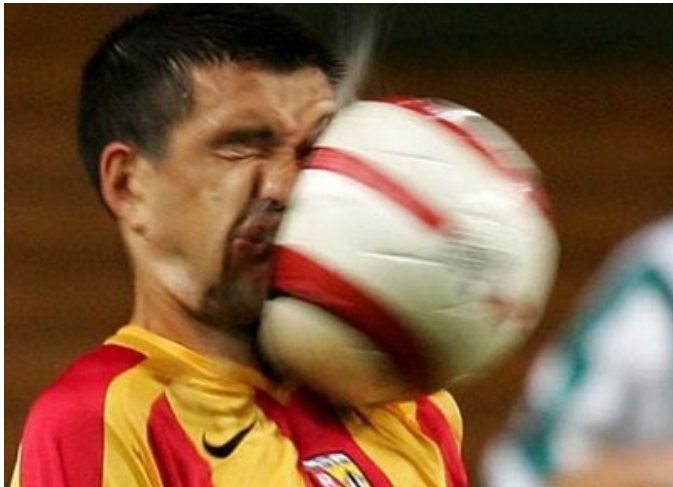
Sometimes I REALLY HATE soccer.

Looking out into the audience, he asked, "Is there a pharmacist in the house?"