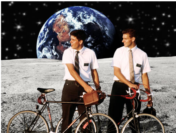
When President said we were opening a new area on the outskirts of the mission, he wasn't kidding, was he?

Once there was a millionaire, who collected live alligators. He kept them in the pool in back of his mansion. The millionaire also had a beautiful daughter who was single.