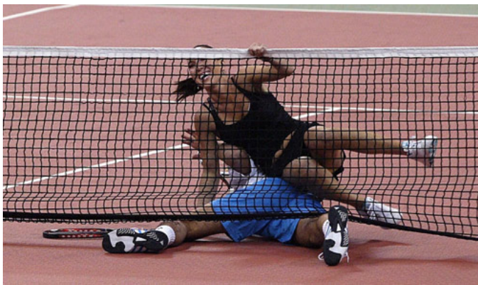
Doubles? Never again!

"Don't worry." said the Auctioneer, "He can talk. Who do you think kept bidding against you?"